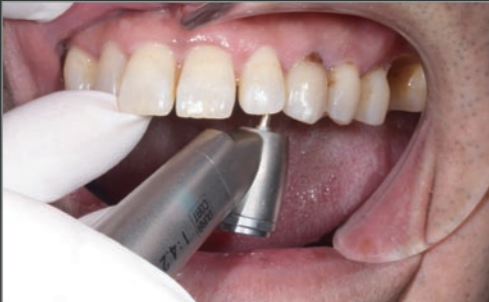
Caries Removal from a Maxillary Left Lateral Incisor's Cervical Area

When working on the palatal side of a second premolar, Ti-Max Z45L ensures that you can operate smoothly and have plenty of working space between the maxillary adjacent teeth.