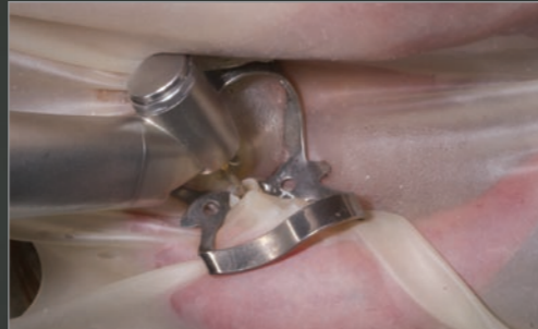
Clarifying the Root Canal Orifice of a Mandibular Right Second Premolar

Securing a solid finger rest on a front tooth enables stable cutting without interference from other teeth. Since you can also freely control the angle of the bur, minimal intervention treatments are also possible.