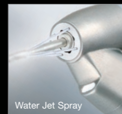
Water Jet Spray

The 45-degree angled head allows easy access to the molar region, minimizing interference from the front teeth and adjacent teeth.