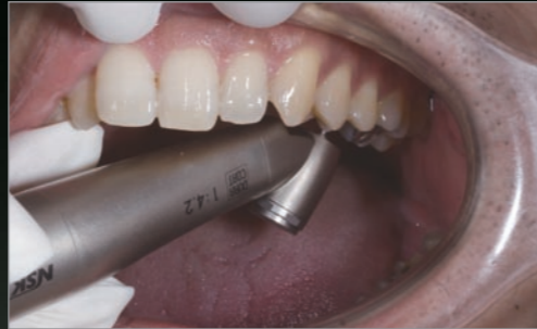
Caries Removal from Maxillary Left Second Premolar on Palatal Side

You can gain a comfortable finger rest without stress thanks to the extra space the slim Ti-Max Z45L creates between the front teeth. It is also easy to maintain the bur at an optimal angle and achieve precise sectioning, even when the operating depth is close to apex.