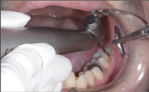
Sectioning a Mandibular Left Impacted Third Molar

You can gain a comfortable finger rest without stress thanks to the extra space the slim Ti-Max Z45L creates between the front teeth. It is also easy to maintain the bur at an optimal angle and achieve precise sectioning, even when the operating depth is close to apex.