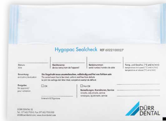
Hygopac Sealcheck, daily seam sealing test

The Hygopac View is the new generation of the Hygopac Plus rotary sealing device.