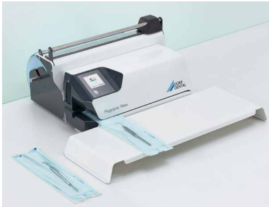
Instrument table and table-top Hygofol Station

The accessories and packaging film in the Hygopac System make your processes a breeze. The daily Hygopac seam sealing test allows you to check seam sealing quality at a glance every day - creating added security and reassurance.